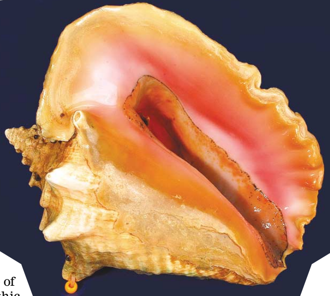
Adult queen conch with flared lip and mantle, which is used to form the shell.

In 1992, queen conch was listed in CITES Appendix II and became the first large-scale fisheries product regulated by CITES. All conch shipments must be accompanied by a CITES permit that states the exporting country has found the specimens