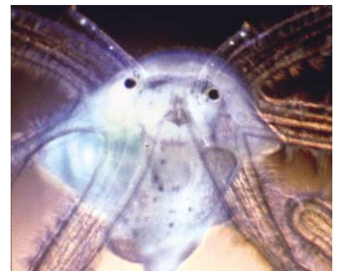
At 21 days old, conch larvae or veligers still feed on plankton.

The "Conch in the Classroom" lesson plans, which are tied to national and state standards, cover geography, fisheries, biology, and aquaculture. Many teachers in the United States and the Caribbean use the lessons as part of their marine biology and science curriculums.